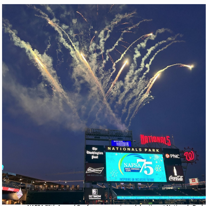
NAFSA 75th Annual Conference opening celebration at Nationals Park.

Another highlight for me included meeting with one of our active ECE® Aid participants, the Ethiopian Community Development Council (ECDC), at its national headquarters in Arlington, VA. I always appreciate meeting with colleagues in person to speak about potential collaborative projects and how we can support each other with those we serve. It was an excellent meeting, and I thoroughly enjoyed speaking with staff at ECDC.