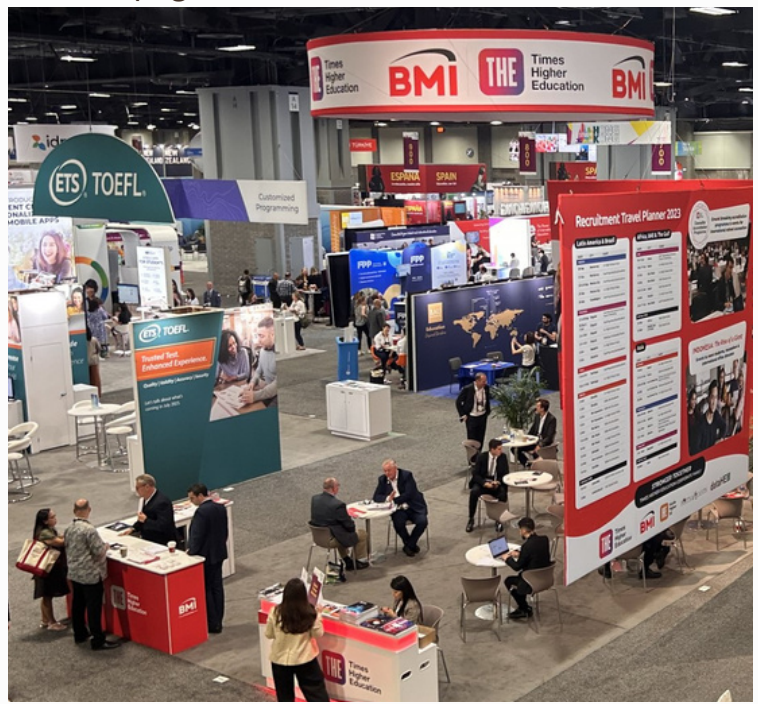
NAFSA 75th Annual Conference expo hall.

This year, I was fortunate enough to present at one of the poster fairs, which I will talk about more on the next page.